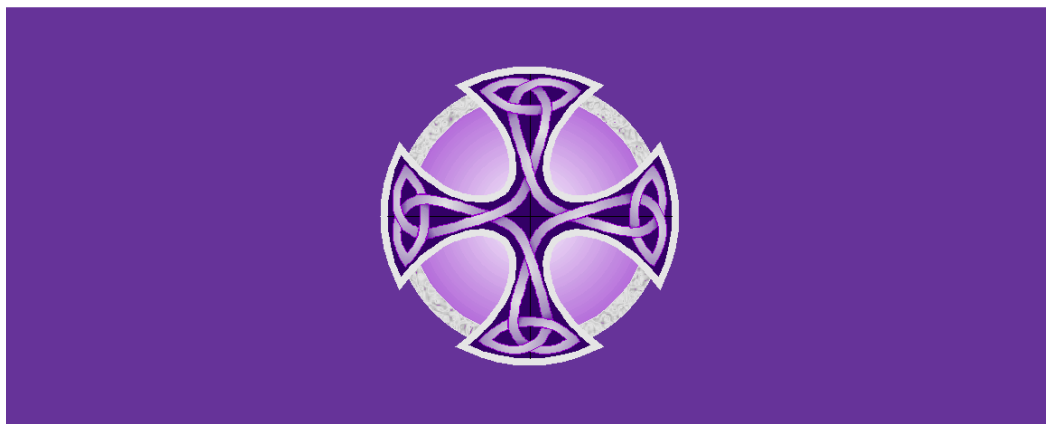
Suggested design – for All Saints Church, North Baddesley

The triskele knot, representing the Holy Trinity, is found in each arm of the cross. I see this as representing God's presence in each of the seasons, in life and death, in summer and in winter. I have changed the design so that it is a continuous knot, again, linking all the seasons together, the unchangeable God, who is with us forever.